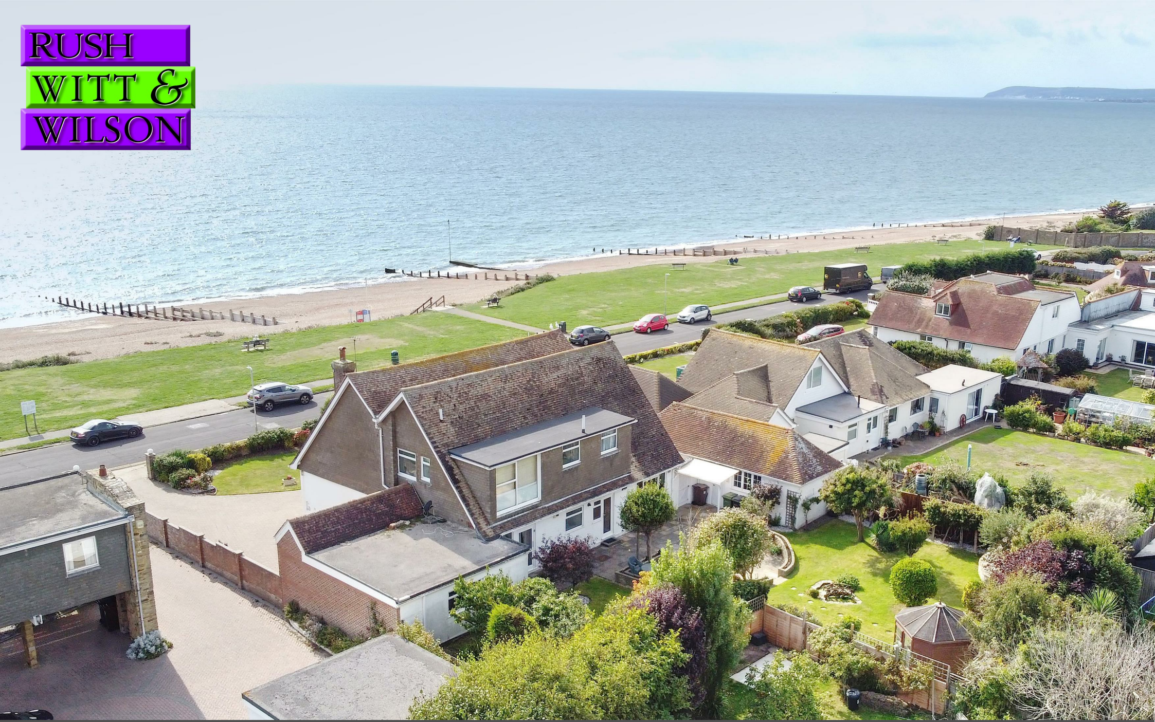
Beaulieu Lodge 10 Beaulieu Road, Bexhill-On-Sea, East Sussex TN39 3AD £1,200,000