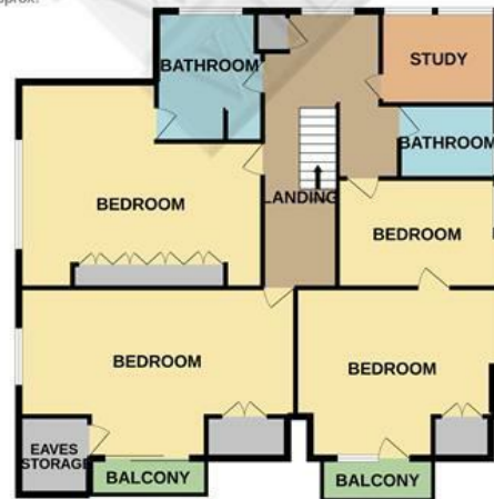
TOTAL FLOOR AREA : 3603 sq.ft. (334.8 sq.m.) approx.

Whilst every attempt has been made to ensure the accuracy of the floorplan contained here, measurements of doors, windows, rooms and any other items are approximate and no responsibility is taken for any error, omission or mis-statement. This plan is for illustrative purposes only and should be used as such by any prospective purchaser. The services, systems and appliances shown have not been tested and no guarantee as to their operability or efficiency can be given. Made with Metropix ©2022